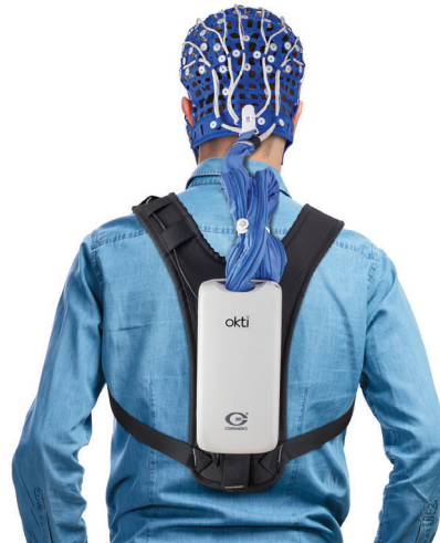
Reusable adult backpack

Designed to give ample support and flexibility to move around. Comes in both reusable and disposable designs.