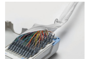
Disposable snake cable