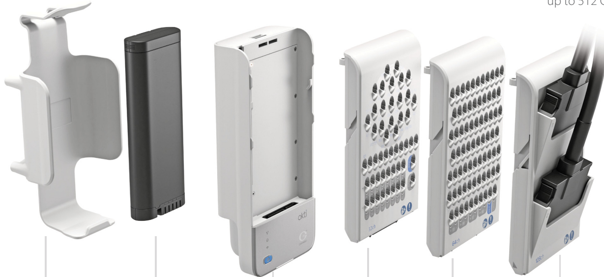
Multi use bracket for fixed studies

Multiple units can be tethered to provide larger connections, up to 512 Channels.