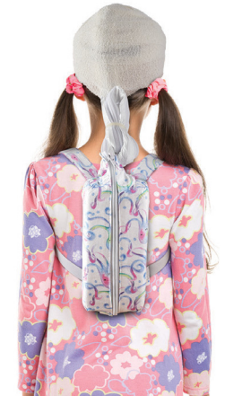
Disposable child backpack