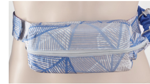
Disposable adult waist pack