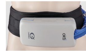
Reusable adult waist pack

Distributes load more effectively for children, whilst still giving them the freedom to play. Pattern design is playful and fun, easing the anxiety of the process.