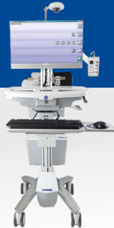
Combination ...for EEG, EMG/NCS and EP