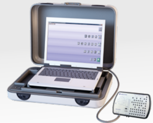
Mobile and portable EEGs ...for more comfort